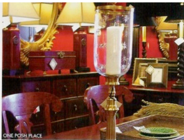
ONE POSH PLACE

BOUTIQUES STRIVE TO FIND PIECES THAT PROVIDE A "SIGH" FEELING WHEN CUSTOMERS SEE THEM.