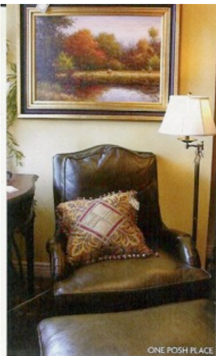
ONE POSH PLACE